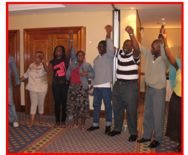
The inaugural Fellows celebrate ending their Fellowship year.

2012 ADVOCACY FELLOWSHIP APPLICATIONS OPEN MAY 16 2011